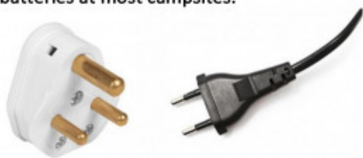
Image of 3 pin round and two pin. These plugs will work in Namibia.

Electrical plugs are 220 V and are 3 pin (round-pin as opposed to square pin, the same as in South Africa). Adaptors can be purchased in Windhoek and Wild Dog Safaris also sells these at their offices. It is possible to re-charge batteries at most campsites.