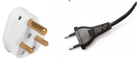
Image of 3 pin round and two pin. These plugs will work in Namibia.

Electrical plugs are 220 V and are 3 pin (round-pin as opposed to square pin, the same as in South Africa). Adaptors can be purchased in Windhoek and Wild Dog Safaris also sells these at their offices. It is possible to re-charge batteries at most campsites.