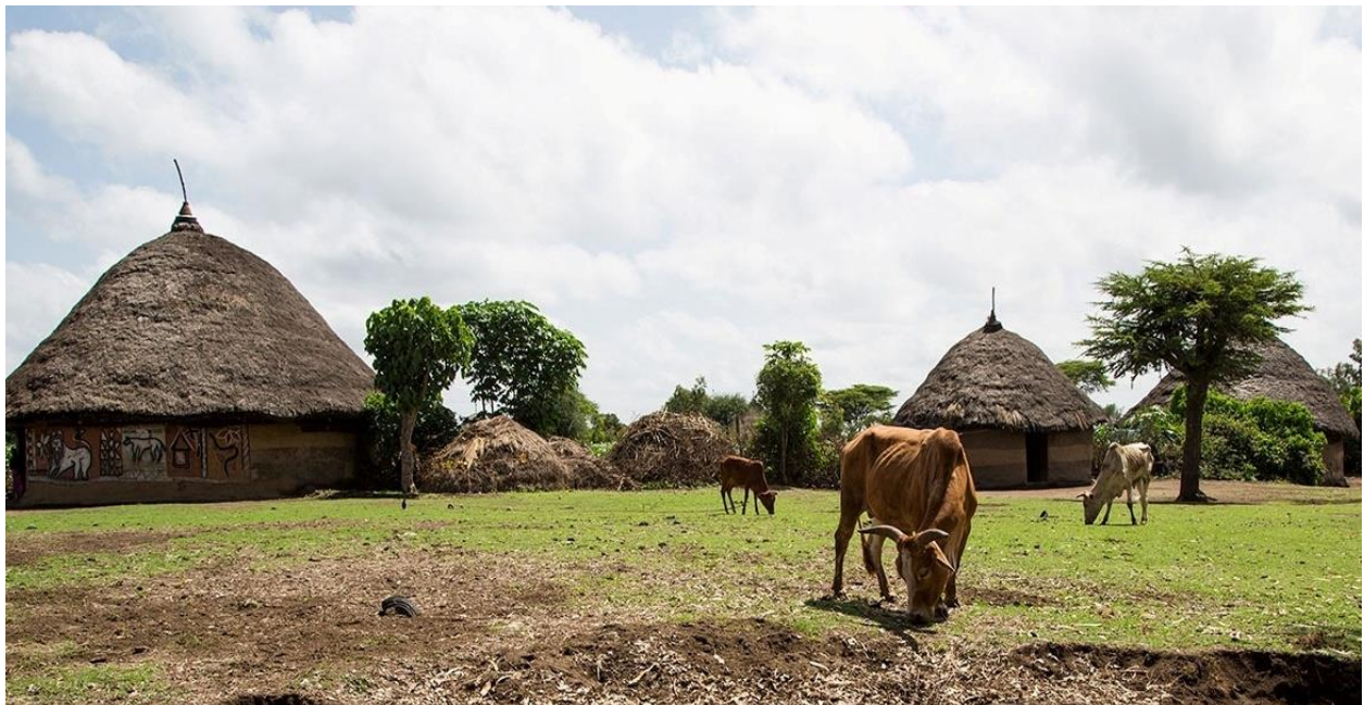
Picture: Alaba Village

After breakfast, drive to Hawassa. On the way visit the Alaba people Village who are known for the images they paint on the inside and outside of their huts. Then keep drive to Hawassa. Overnight in Haile Resort