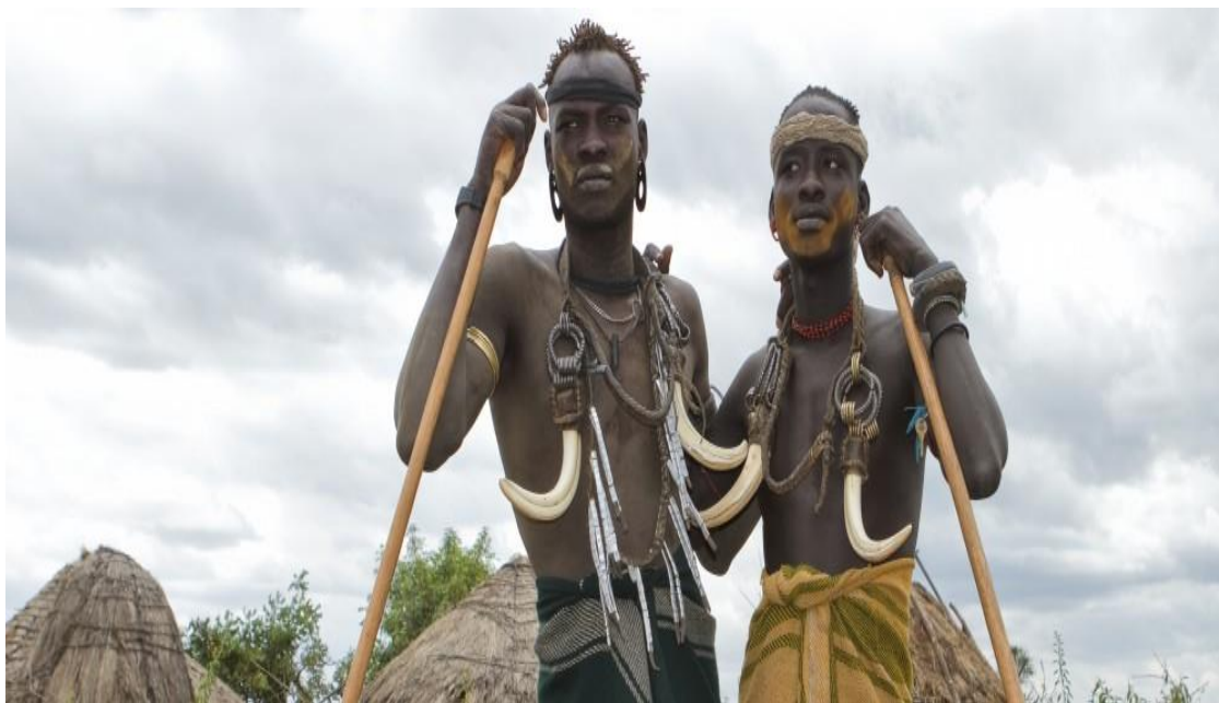
Pic Mursi Boys

After check in to hotel, drive to the Mursi village through Mago national park to visit the Mursi tribe. The Mursi people are the Nilo Saharan language speaker and famous for their women putting lip plate, made of clay and up to 15cm in diameter, on their lower lip and men for their stick fighting (donga). After visit, drive to Turmi.