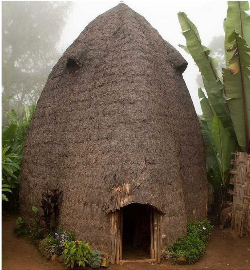
Picture: Elephant Shaped traditional Dorze hut, Chench Village, Arbaminch