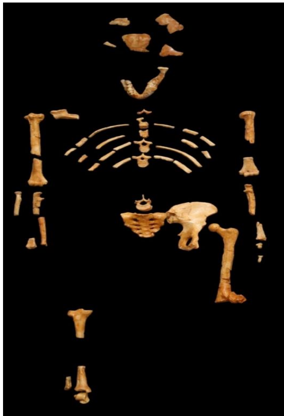
Pic. The skeleton of Lucy, a 3.2 Million fossil remain, National Museum, Addis Ababa

Up on arrival at Bole international air port and met by Ghion travel and tours representative and transfer to hotel. After check in to hotel you will have city tour of Addis, Which includes National Museum- the home of the famous complete hominid fossil remain of Lucy dates 3.2 million years back, Mount Entoto- panoramic view point at the highest peak in Addis with an altitude of 3200 meter above sea level, trinity cathedral- a beautiful church with a baroque style of European architecture unique to both Ethiopia and Africa, Ethnographic museum and Merkato (the largest open air market in Africa). Overnight in Azzeman Hotel