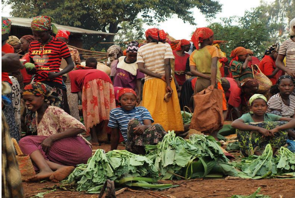
Picture: Ari Tribe, at Jinka Market