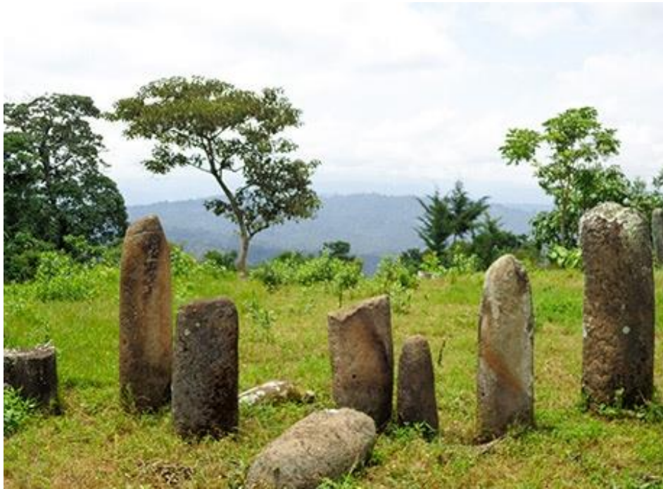
Picture: Tiya Stele Field

Morning, drive to Arbaminch. On the way, visit Tiya Stele site (one of the world heritage site registered by UNESCO) and Melka Kunture archeological site. Then keep driving to Arbaminch and Overnight in Paradise Lodge