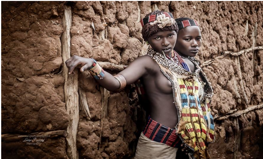
Pic. Hamar girls

In the late afternoon, visit the Hamar Tribe with their village. They are one of the most known tribes in Southern Ethiopia. They inhabit the territory east of the Omo River and have villages in Turmi and Dimeka. Very colorful bracelets and beads are worn in their hair and around their waists and arms. The practice of body modification is used by cutting themselves and packing the wound with ash and charcoal. Some of the women wear circular wedge necklaces indicating that they are married. Men paint themselves with white chalk to prepare for a ceremony. Hair ornaments worn by the men indicate a previous kill of an enemy or animal. Overnight in Buska Lodge or Turmi Lodge. (Paradize lodge)