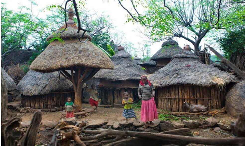
Picture: Konso Village