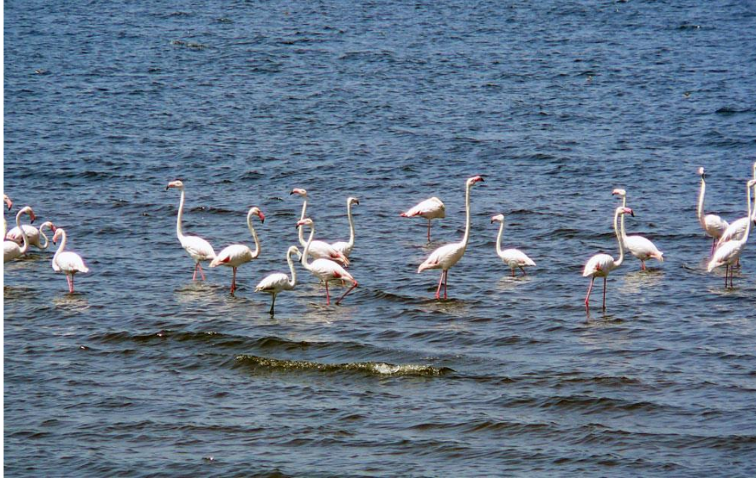
Picture: Flamingos at Abyata-Shala National Park

Day 10: Drive to rift valley lakes to lake Langano bird watching and swimming in the fresh water lake. Overnight Sabana Lodge.