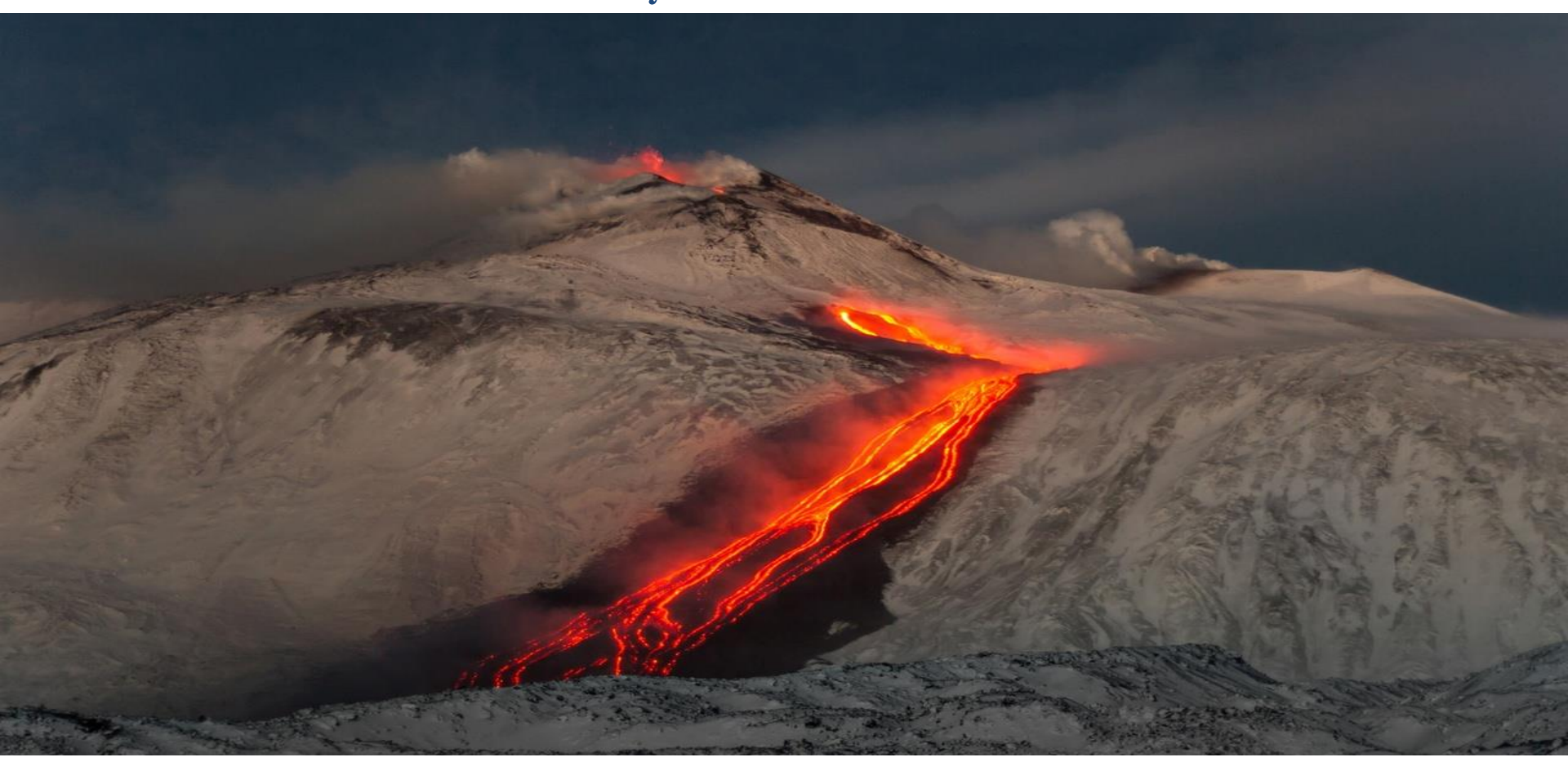
Day 7 – Mount Etna

Today you will discover Europe's highest active volcano: Mt. Etna. The most direct way is to climb up the east slopes through vineyards and citrus groves, chestnut woods and bizarre lava landscapes until you reach the station "rifugio Sapienza" at 1.900 m.a.s.l. Here you can see the lava streams that during the eruption 2001 destroyed the cable car and part of the bus station. If weather conditions permit, it is possible to take an optional ride with the recently rebuilt cable car and 4-wheel-driven minibuses until a height of ca. 2.800 mts right underneath the smoking summit craters. On the way down, have a stop in Zafferana Etnea. The little town is the centre of Sicilian honey production: chestnut honey is excellent with pecorino cheese, eucalyptus honey helps in case of cold, the choice is large – just try! Return to your hotel, overnight, 4* Hotel.