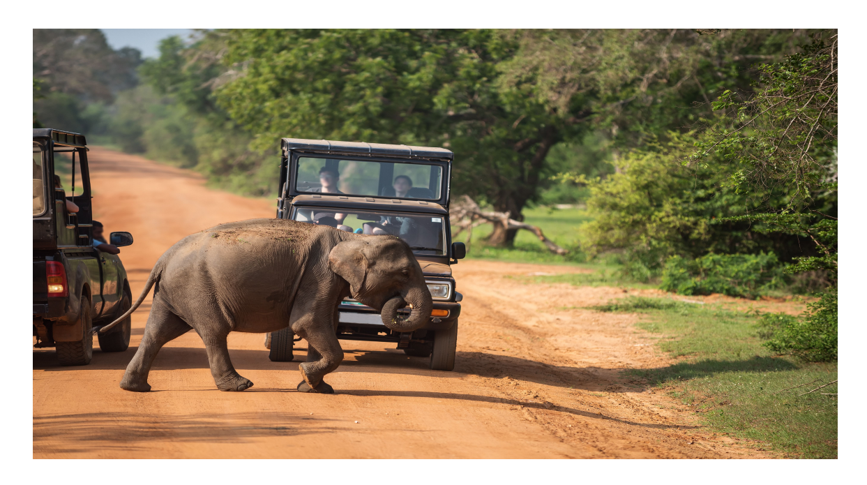
DAY 10: TISSAMAHARAMA - COLOMBO (260 Km/ Approx. 05 Hrs Drive)

After breakfast, take a drive around Tissamaharama (the town is dotted with ancient buildings dating to as early as the 3rd century B.C.) and Kataragama (an important holy pilgrimage town to Buddhist, Hindu, Muslims and indigenous Veda people of Sri Lanka) to visit the places of interest before proceeding to Colombo. Continue drive to Colombo and take a brief tour of Colombo in the afternoon. Proceed to your hotel in Colombo for the night.