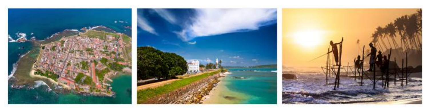
In the afternoon visit Turtle Hatchery

architecture, with fortifications that resemble those in the coastal areas of Portugal. When it comes to fortified towns, nothing can compete with the Dutch Fort in Galle. This World Heritage Site on the south coast was the main port of call for ships sailing between the East and Europe.