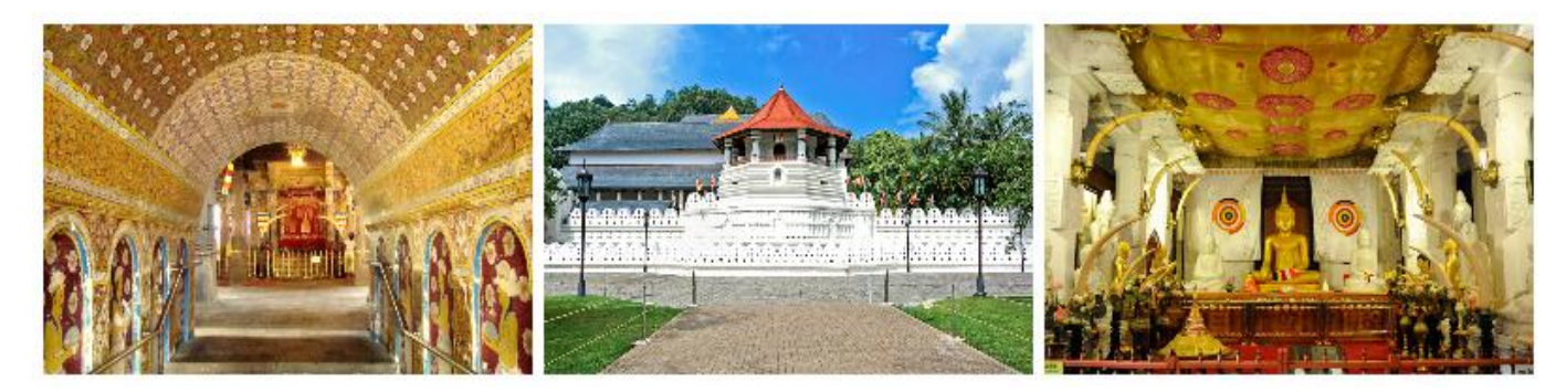
Dinner & Overnight stay at Oak Ray City Hotel or similar.

In the crown jewel of the city, Kandy is the famed Sri Dalada Maligawa, also known as the Temple of the Tooth. The golden-roofed Temple of the Sacred Tooth houses Sri Lanka's most important Buddhist relic – a tooth of the Buddha. The entire complex is over three centuries old at least, and has seen many a king's rise and fall. It has seen bloody wars and peaceful reigns and is one of the most historical places still standing in the island. The entire temple complex, from peaked tiled roofs to white walls with large airy windows, is built using classical Kandyan architecture.