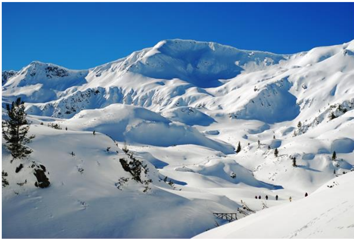
The circuit of Bunderista river above Vihren hut