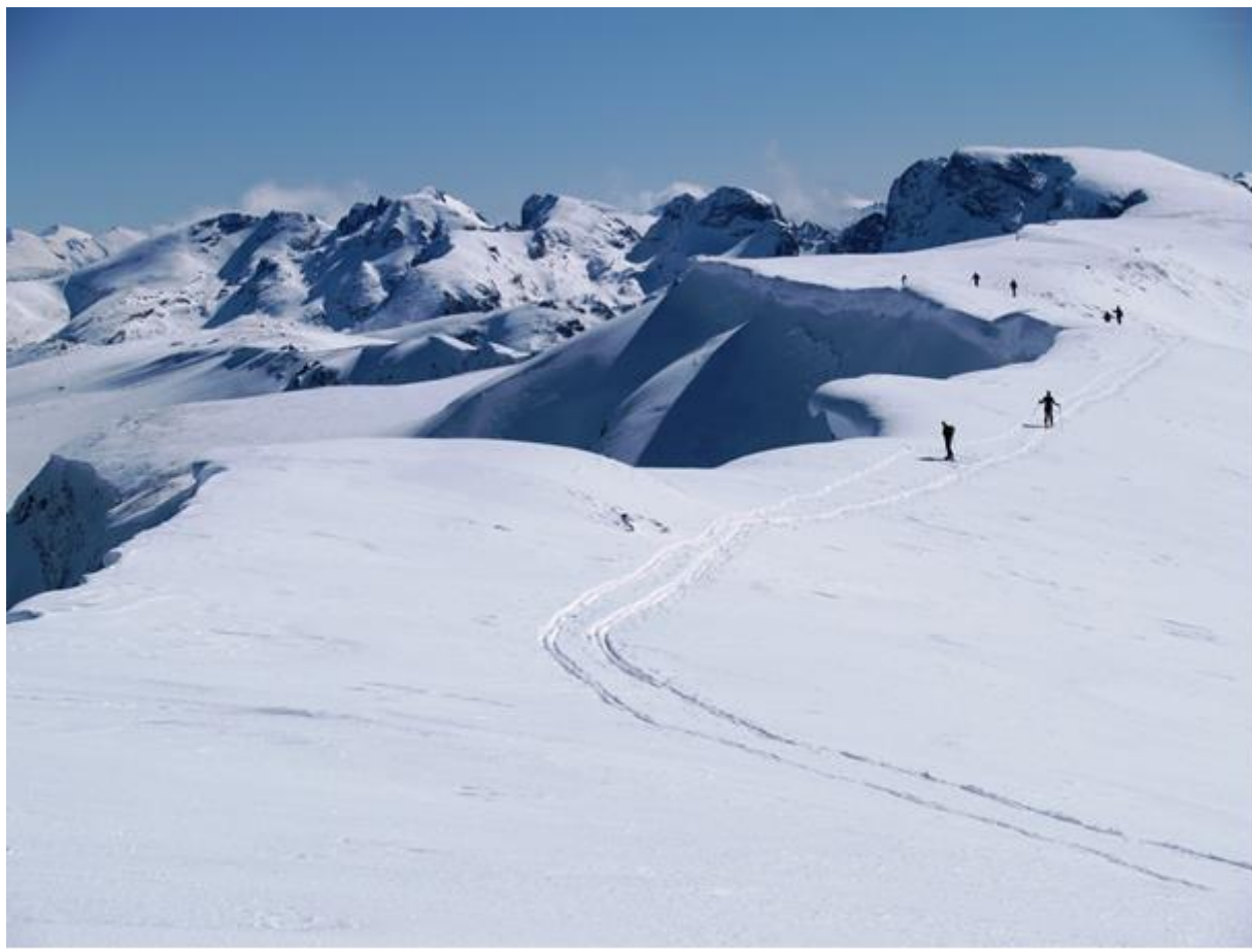
Rila main ridge, Maliovitsa area in the background

Today you ski from Rila lakes hut to the small, ski & mountaineering center Maliovitsa.