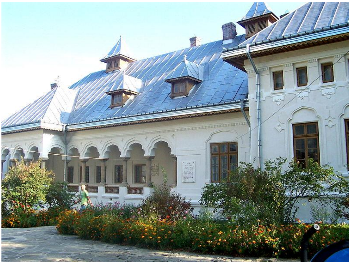
Accommodation at your hotel in Piatra Neamt.