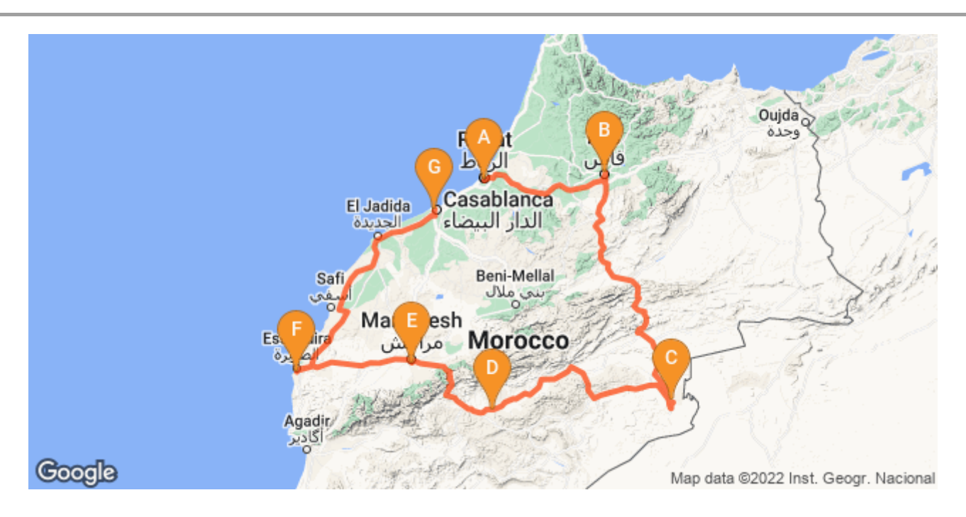
Click here to view your Digital Itinerary

Reference: Oll22/KM230419-30 Date of Issue: 18 May 2022 19 April 2023 - 30 April 2023