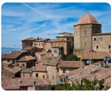
Volterra Volterra, Tuscany, IT, 56048