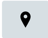
Amalfi Coast Campania, IT

Today your personal driver will pick you up at the hotel to drive around the Amalfi Coast. Drive along the UNESCO World Heritage listed Amalfi Coast on 'state route 163' – a masterpiece of human engineering. You will stop in Amalfi to admire its Cathedral. Following the natural outlines of Europe's most spectacular coastline, you will drive through picture-perfect villages, such as Ravello and verdant cliffs dotted with waterfalls.