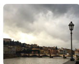
Florence Italy Florence, Italia

This morning at the hotel lobby you will meet your personal guide to discover the city. With the walking tour you will discover the heart of the city and stroll through streets, alleys of the medieval quarter to Palazzo del Bargello (exterior visit only) and Piazza della Signoria, where sculptures beckon. Continue to Santa Croce Church (Basilica of the Holy Cross), famed as the “Westminster Abbey of Florence”. It is a gorgeous Florence church with frescoes by Giotto, architecture by Brunelleschi and houses the tombs of Michelangelo, Galileo and other Tuscan cultural giants. Next, visit the Accademia Gallery with the famous Michelangelo's masterpiece: The David. You are able to view the museum's other unique pieces, including a room dedicated to Michelangelo. Continue walking along the Medici Chapels (exterior view only) and Basilica di S. Lorenzo, church of the once influential Medici Family (exterior view only). Finally arrive at Piazza del Duomo and marvel at the vast Cathedral. You will continue to the visit to Uffizi Gallery , one of the most beautiful and famous museums in the world boasting a hall of fame of the most important artists of all times: Leonardo da Vinci, Raphael, Michelangelo, Botticelli, Caravaggio and many others.