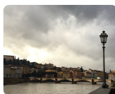
Florence Italy Florence, Italia