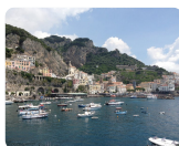
Costa Amalfitana Amalfi, CAMPANIA, ITALIA