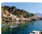
Amalfi Coast Campania, IT