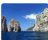
Capri Capri, Campania, IT