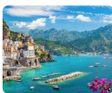
Sorrento Sorrento, Campania, IT, 80067