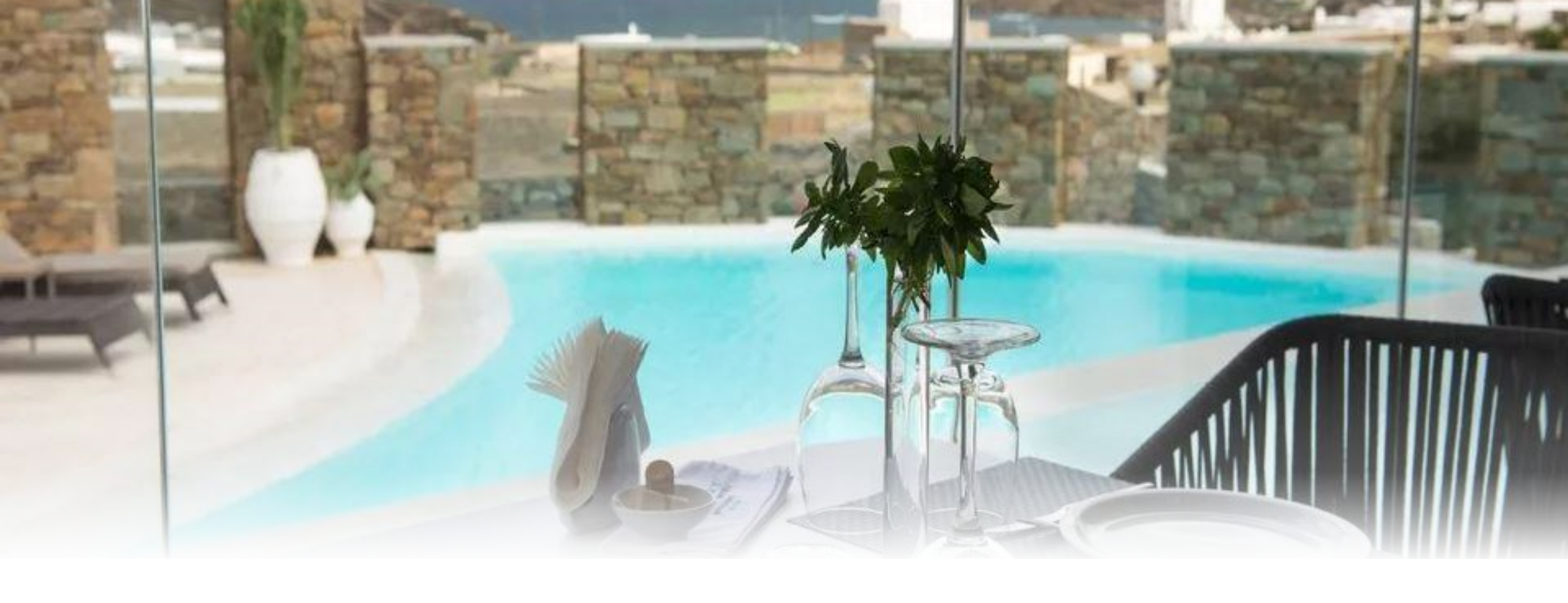
Ftelia Bay Hotel