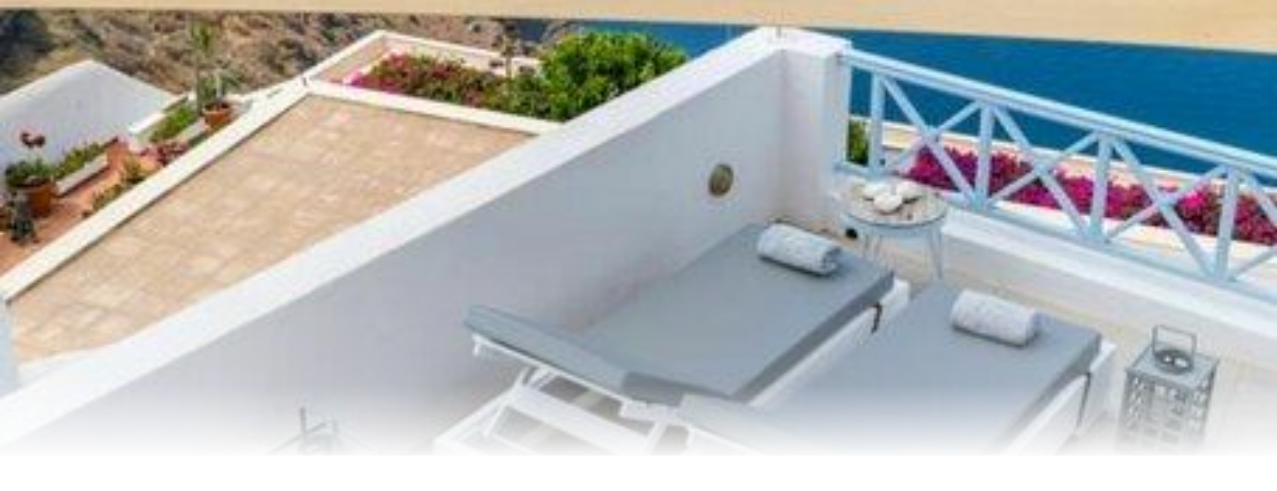
Blue Dolphins Apartments & Suites